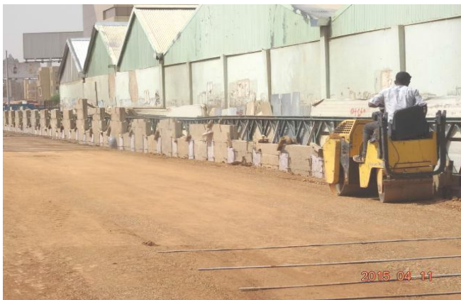
Fig. 10 Compaction by rolling of reinforced backfill soil

The first layer of backfill soil was laid down with 20 cm thickness and compacted at optimum moisture content and maximum dry density. The compaction was tested to make sure that it satisfied the requirements. The steel strips were then placed on compacted soil at a horizontal and vertical spacing of 1m (see Fig. 10). The strips were tied with the MSE walls by bolts on compacted soil layer and this step was repeated until the top design level was reached of the embankment.