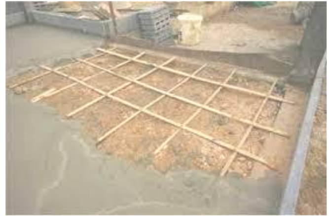
Fig. 1 Bamboo Strips used in earth construction [8]

investigated the effect of Bamboo industry waste on CBR and swelling of the treated soil. The results showed that using such material can improve the CBR value and reduce swelling with increasing fiber content.