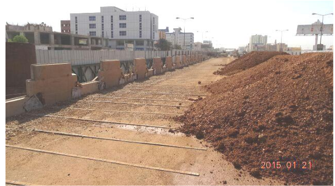
Fig. 8 The backfill material used in construction of MSE

The backfill soil used in MSE structure is granular material (see Fig. 8). The soil physical and mechanical properties such as gradation, plasticity, compaction and strength parameters were measured in the laboratory. The backfill soil used is classified as clayey Sand (SC) of low plasticity and fine content (PI = 12%, percent passing no. 200 sieve = 20%), optimum moisture content 7.5% and maximum dry density 2.21 g/cm 3 and moderate strength (CBR = 35%).