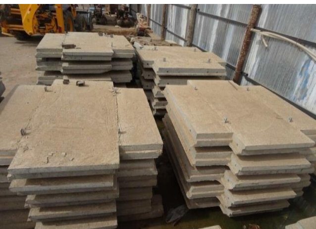
Fig. 7 The fencing precast concrete units

The backfill soil used in MSE structure is granular material (see Fig. 8). The soil physical and mechanical properties such as gradation, plasticity, compaction and strength parameters were measured in the laboratory. The backfill soil used is classified as clayey Sand (SC) of low plasticity and fine content (PI = 12%, percent passing no. 200 sieve = 20%), optimum moisture content 7.5% and maximum dry density 2.21 g/cm 3 and moderate strength (CBR = 35%).