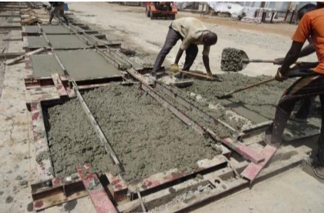
Fig. 6 The MSE Panels casted in site

The type of facing element used in the construction of MSE walls is unreinforced precast concrete units. The facing panels are the only visible parts of the structure and therefore used for their aesthetics and provide protection against backfill sloughing and erosion. The MSE concrete panels were casted in-situ (see Fig. 6). The precast concrete panels have a thickness of 150 mm and of a geometric shape as shown in Fig. 7.