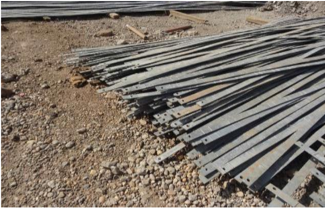
Fig. 5 Galvanized Steel Strips used as soil reinforcement

The type of facing element used in the construction of MSE walls is unreinforced precast concrete units. The facing panels are the only visible parts of the structure and therefore used for their aesthetics and provide protection against backfill sloughing and erosion. The MSE concrete panels were casted in-situ (see Fig. 6). The precast concrete panels have a thickness of 150 mm and of a geometric shape as shown in Fig. 7.