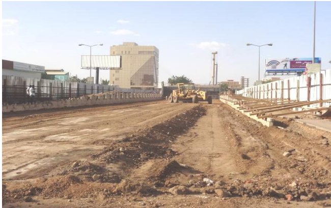
Fig. 9 Setting of the first row of precast facing panels

The first layer of backfill soil was laid down with 20 cm thickness and compacted at optimum moisture content and maximum dry density. The compaction was tested to make sure that it satisfied the requirements. The steel strips were then placed on compacted soil at a horizontal and vertical spacing of 1m (see Fig. 10). The strips were tied with the MSE walls by bolts on compacted soil layer and this step was repeated until the top design level was reached of the embankment.