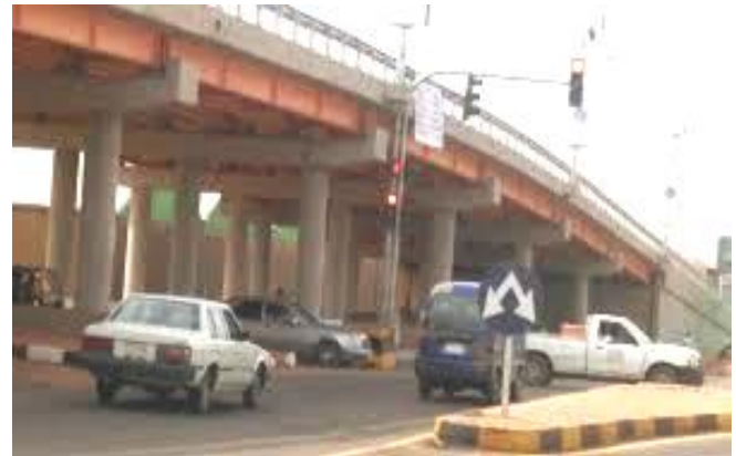
Fig. 4 Side view of Almolid Square Overpass Bridge

This Overpass Bridge consists of eight spans, with total length of 300m, 10m width and 4.5m height at the highest point. Foundation type adopted is piles and combined footings connected with square concrete columns with tie beams, and circular columns connected with concrete crosshead which contain pedestal with elastomeric bearing beds, with steel girders and deck slabs (See fig. 4).